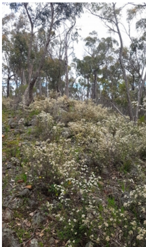
Hillside covered in Dusty Miller