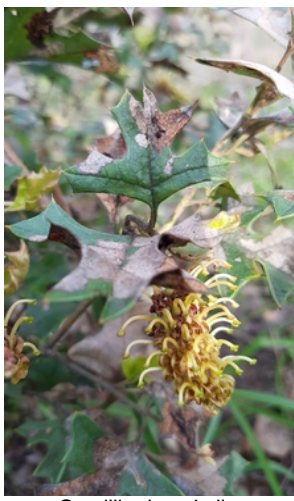
Grevillia dryophylla showing leaf damage