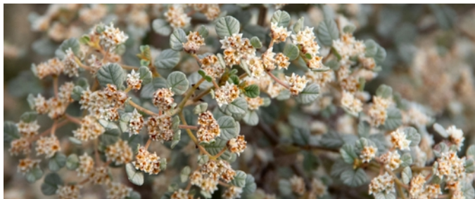
Dusty Miller at stop 2

On 18th August visiting these sites with Geraldine, the Grevillea dryophylla looked very healthy. Since then there appears to have been extensive attack (insects?) on leaves. No other plants seem to be affected.