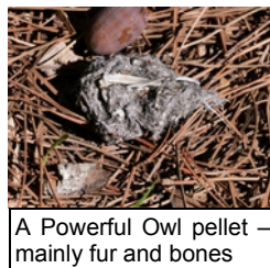
A Powerful Owl pellet – mainly fur and bones

Roost: It needs bushy trees often found in gullies, which provide protection from both the elements and mobbing birds. Their presence is generally indicated by ground evidence - "whitewash", pellets containing bones, and feathers.