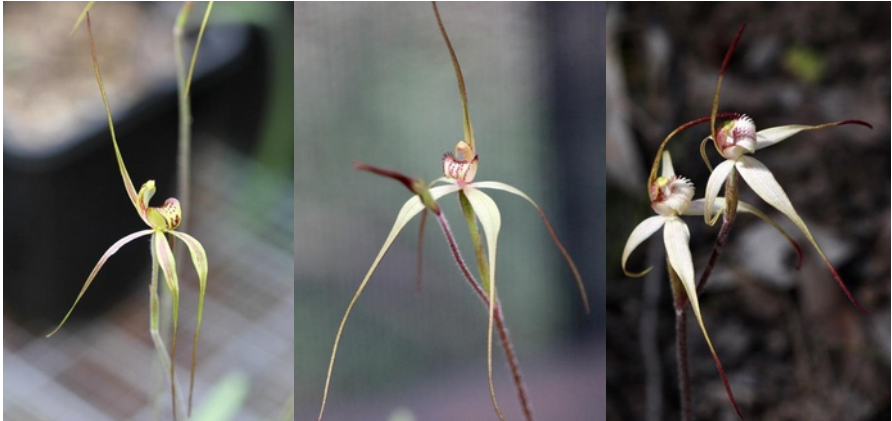
1. Caladenia audasii