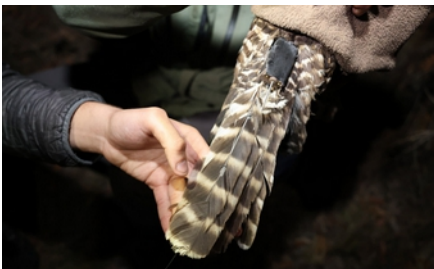
A GPS transmitter attached to the tail

With a dense accumulation of data points, the area used can be defined as a “core area” with peripheral excursions. The only overlaps occur in the latter. Individual birds are very protective of their territory.