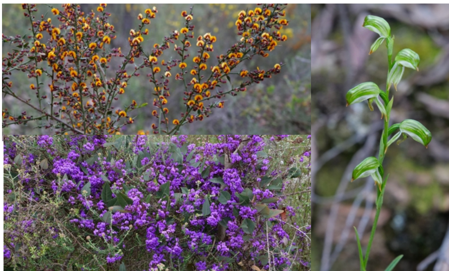
Above: Splashes of colour – Gorse Bitter-pea and Purple Coral-pea; right: Tall Greenhood. Below left: Fairy Wax-flower with characteristic pink buds.