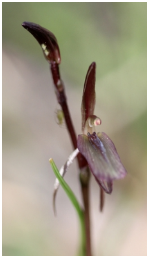
Gnat Orchid