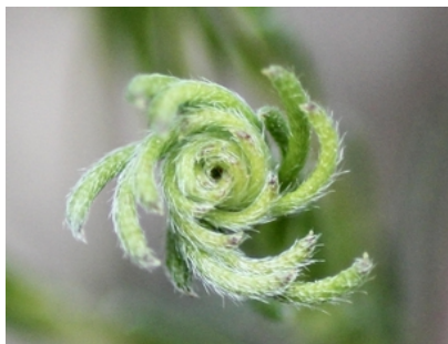
We also saw this intriguing small green plant that was unfurling its new growth like a Catherine Wheel. Any suggestions about its identity welcome!

Our excursions this spring have born out the expectations of a bumper wildflower season following an unusually wet year. As we go to print, there is still a great showing which will continue well into October, so go out there and enjoy! Wednesday walks 3 and 4 will be featured in next month's issue of CN - ED.