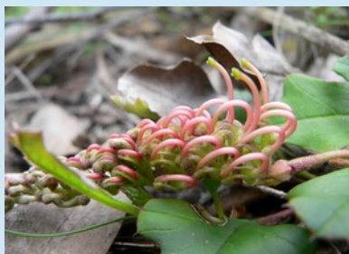
G obtecta