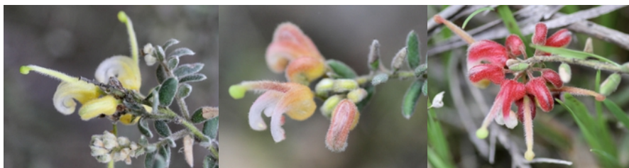
Three colour variants of Grevillea alpina , Kalimna walk – Cathrine Harboe-Ree