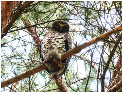
A Powerful Owl with possum prey

Monthly newsletter of the Castlemaine Field Naturalists Club Inc.