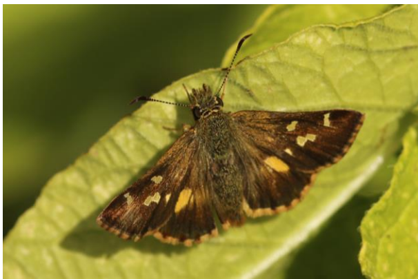
Barred Skipper (female). Compared to the male, above, note the different shape of the spots on the forewing and the large single spot on the hindwing.