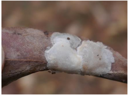
Birds were observed dropping these hard and coarse Lerps into the birdbath to soften them.