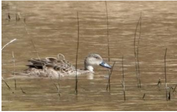
Grey Teal Duck ( Anas gracilis )