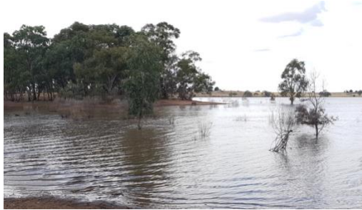
Tullaroop reservoir showing high water level