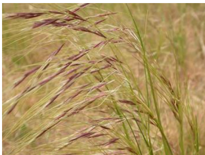
Chilean Needle Grass, Nassella neesiana .

To try and ensure our progress is continued, CFNC put in a budget submission in January, asking Council to provide funding for a Weeds Officer and adequate ongoing funding for council staff to remove needle grasses and other weeds. Other groups and individuals also did submissions asking for more funds for weed removal and natural environment in general.