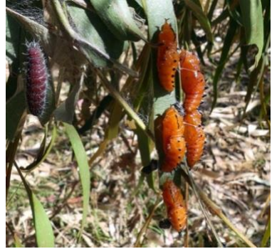
Imperial Jezebel Pupae

Monthly newsletter of the Castlemaine Field Naturalists Club Inc.