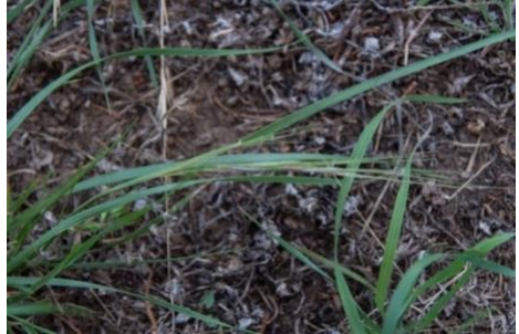
Texas needle-grass, Nassella leucotricha Woodman St, Castlemaine.

Six years ago the Gardens had a dense infestation of Cane Needle Grass ( Nassella hyalina ) as well as some Texas NG ( N. leucotricha ) and Chilean NG ( N. neesiana ). Cane NG, which is on the national Alert List for Environmental Weeds, is not common in Victoria outside of volcanic soils north and west of Melbourne. Needle grasses invade and take over not only grazing land, but also native grasslands, of which only about 1% are left in Victoria.