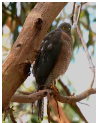
Noel Young Sparrowhawk , Happy Valley track.

Discussion decided the best possible identification is a juvenile Brown Thornbill.