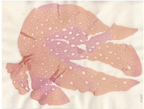
Algae Kallymenia cribrogloea

Evolutionarily, the red algae are the oldest and the greens the most recent. Due to their different pigments, they occupy different habitat niches, the reds having adapted to low light and therefore being found in the deeper ocean or under rock shelves and other plants. Variations are also found in the structure of the algae, ranging from a unicellular/multinucleate plant to complex forms. Life histories also vary, including some groups with large isomorphic sporophyte and gametophyte stages, others with heteromorphic sporophytes and gametophytes, or with life histories more analogous to angiosperms.