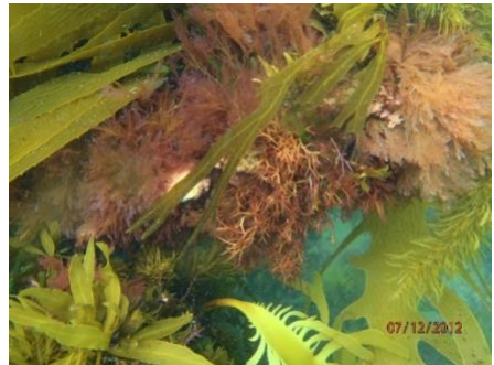
Rockpool garden at Point Lonsdale.