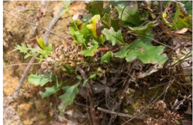
Grevillea obtecta .

Our club is planning to conduct some targeted surveys for the species in areas near where it has been reported in order to ascertain the extent of its range. We will also carry out searches in some of the outlier areas where there are earlier reports. These are to check whether these earlier sightings are accurate or if they are a case of incorrect identification or inaccurate location.