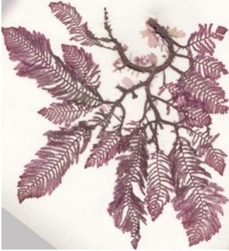
Algae Heterosiphonia muelleri