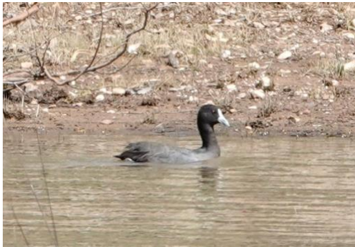
Being watched - Eurasian Coot ( Fulica atra )