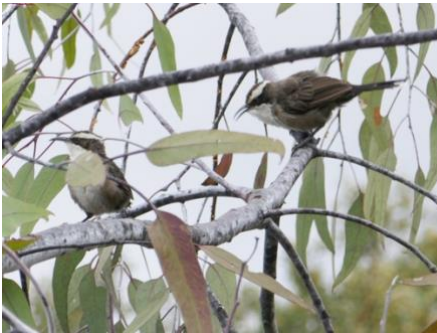
White-browed Babblers ( Pomatostomus superciliosus ).