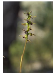
Corunastylis 'inland'

The photo shows the orchid Corunastylis 'inland' at the Mia Mia track. A recognised species that had not yet been formally named when photographed in 2017.