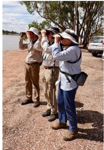
'The Watchers'