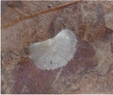
Example of the delicate lacework of Lerps.