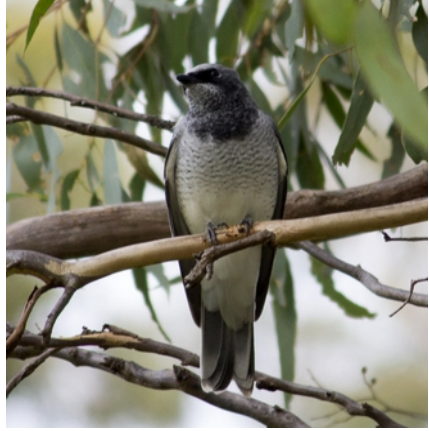
Koala – seen a couple of weeks ago, Dunn’s Track, Muckleford forest. Apparently seen occasionally in this area according to Geoff Park and Geoff Neville. Right: White-bellied Cuckoo-shrike – dark phase, near Gough’s Range.