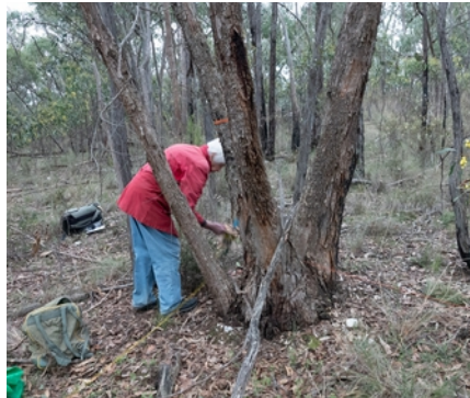
Left: Some of the group recording plant information during the survey. Right: Leslie Perkins setting up the running lines.