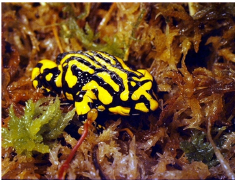
The critically endangered Corroboree Frog

Monthly newsletter of the Castlemaine Field Naturalists Club Inc.