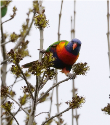
Rainbow Lorikeets – well they haven’t taken over yet, but I often see a few around the Murphy Street trees in Wesley Hill, and sometimes in town. Here they are chewing seeds in a garden tree. I counted seven on this occasion. (July 30)