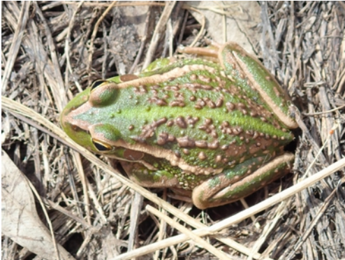
Growling Grass Frog.

Matt then explained how we can use this knowledge to design strategies for protecting frogs from chytrid disease. The fungus is obviously now too widespread for tackling eradication or containment (sound familiar?) but control and mitigation are possible. Individual frogs can be treated with anti-fungals, heat and salt but this is not possible at a population level. The fungus can survive in wet conditions for up to 3 months and there are multiple host frog species, so a cleaned frog returned to the wild is likely to be rapidly reinfected. Matt described projects for three species of frogs that are in decline. The first was to create and identify environmental refuges for the Growling Grass Frog, Litoria raniformis , which is listed as endangered in Victoria. Following extensive mapping of temperature and salinity of wetlands through central and northern Victoria, sites where chytrid would thrive were predicted. This was confirmed by the decreased incidence of the Growling Grass Frog detected at those wetlands. As a result, it was decided that the Winton Wetlands in northern Victoria with warmer temperature and higher salinity would provide a suitable refuge for this frog. So populations are being collected