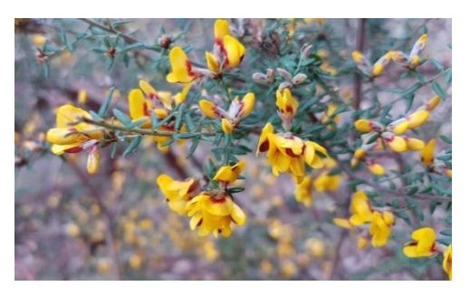
Golden Bush-pea, Pultenaea gunnii.