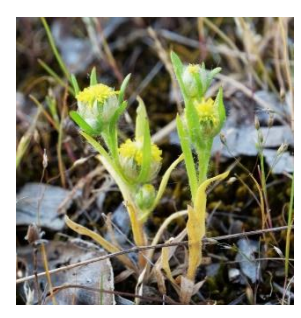
Common Sunray, Triptilodiscus pygmaeus