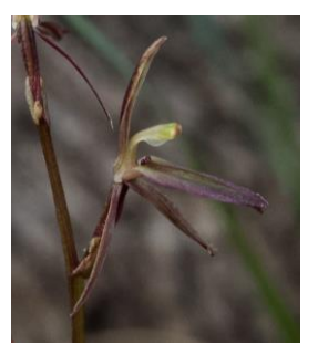
Small Gnat Orchid, Cyrtostylis reniformis