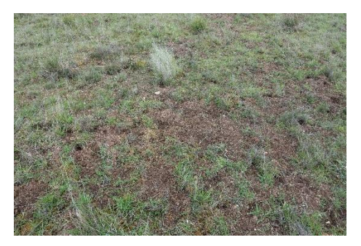
The small marsupials spend much of their lives digging for fungi and invertebrates. They can turn over enormous amounts of soil and speed up the decomposition of leaf litter.

of the smaller nocturnal mammals that emerged from their hiding places after the sun had set. There were good numbers of these animals visiting the garden and the mown grass near the house and sheds. The group was able to get close looks at Rufous Bettong, Brush-tailed Bettong and Long-nosed Potoroo which are all breeding successfully on the property. These are all species that are now rare or extinct in the wild in Victoria. Southern Brown Bandicoots are also doing well on the property, but are declining within part of their range in south-east Australia and subject to special management in some areas. We also saw smaller numbers of Rufous-bellied Pademelon, now extinct in the wild in Victoria and Red-necked Wallaby which may be declining in western Victoria.