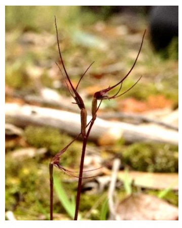
Mayfly Orchid, Amianthus caudatus.