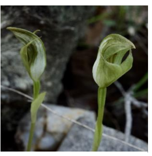
Blunt Greenhood, Pterostylis curta