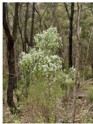
Cypress Daisy-bush, Olearia teretifolia.