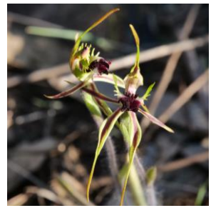
Brown-clubbed Spider-orchid, Caladenia parva