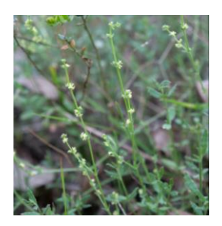
Bedstraw, Galium sp.