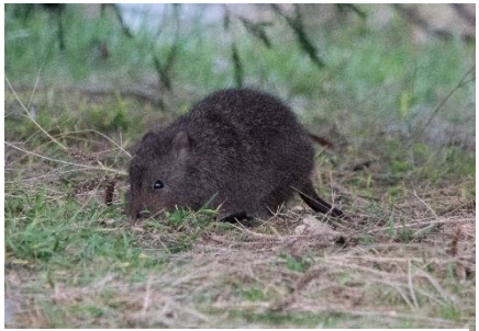
Long-nosed Potoroo, now rare with a patchy distribution in Victoria.