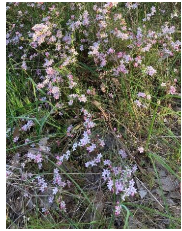
Fairy Wax-flower, Philotheca verrucosa