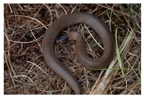
Little Whip Snake, Suta flagellum . The orange band across the snout is diagnostic.