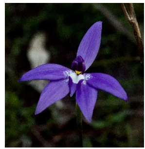
Wax-lip, Glossodia major