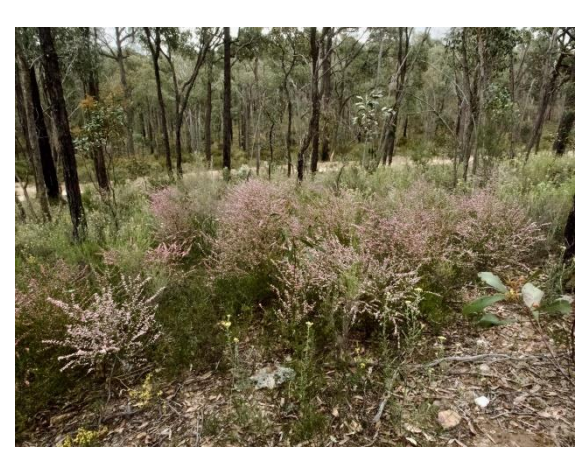
A hillside of Sticky Boronia, Cyanothamnus anemonifolia.