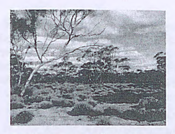
Triodia scariosa at Scotia Santuary