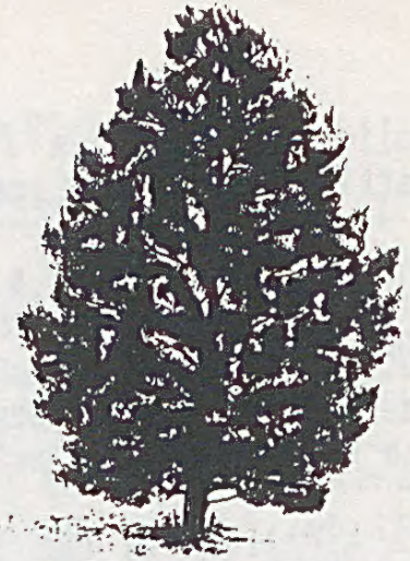
White Cypress Pine