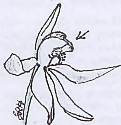
Dusky fingers Caladenia fuscata Note: Has forward pointing extensions on the lateral lobes of the labellum like an upturned collar.