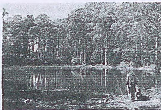
Sanatorium Lake, Mt Macedon.