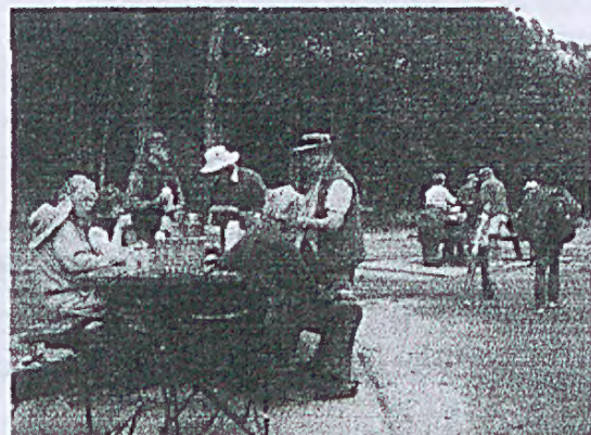
Afternoon tea at Day's Picnic Ground, Macedon.