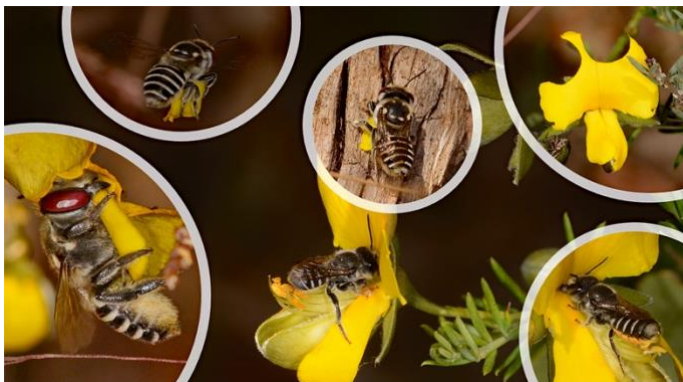
Bees: This leaf-cutter bee, Megachile ordinaria , builds an urn out of petals, in this case Common Wedge Pea, Gompholobium huegelii , in which to store its provisions. Bottom right is a female with a heavy pollen load under her abdomen.