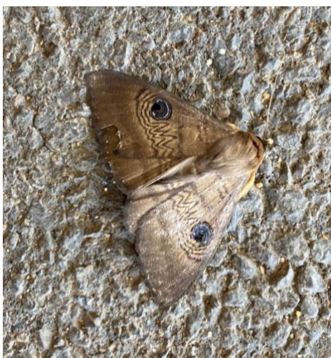
Southern Moon Moth ( Dasypodia selenophora ). This large, nocturnal moth is predominantly found in the southern regions of Australia, including Tasmania, and extends its range to Norfolk Island, New Zealand, and Macquarie Island.