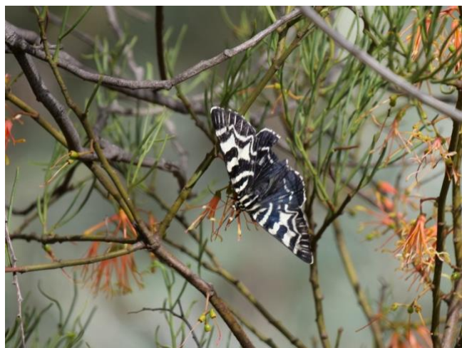
Mistletoe Day Moth ( Comocrus behrii ) on Wire Leaf Mistletoe ( Amyema preissii ) near Forest Creek.