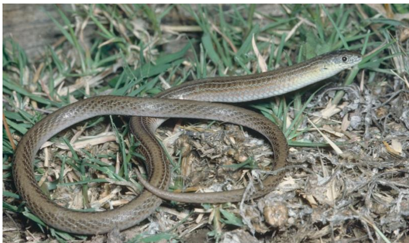
https://collections.museumsvictoria.com.au/species/8389