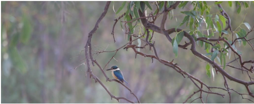
Sacred Kingfisher ( Todiramphus sanctus ) Observed during Annual Challenge Bird Count.