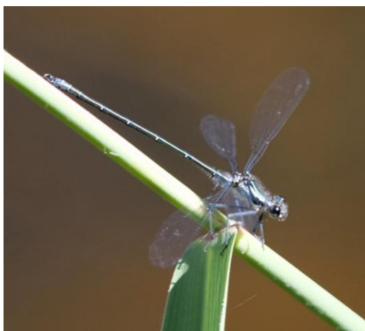
Common Flatwing Damselfly ( Austroargiolestes ictromelas ) flying over Forest Creek, mid-January.