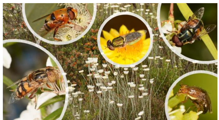
Jewel Beetles: Not all beetles are as colourful as these Jewel Beetles. The adults are nectar feeders and are very specific about which flowers they rest and feed on. Clockwise from top left.