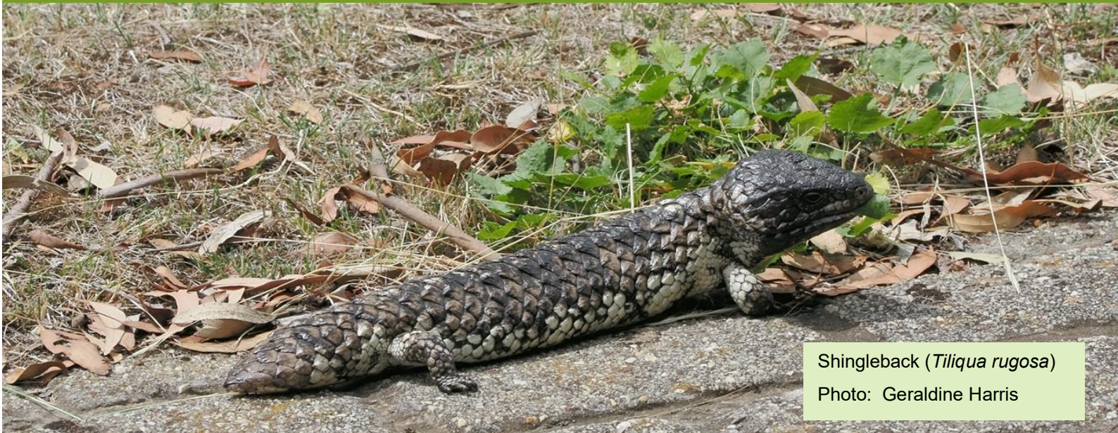
Shingleback ( Tiliqua rugosa )