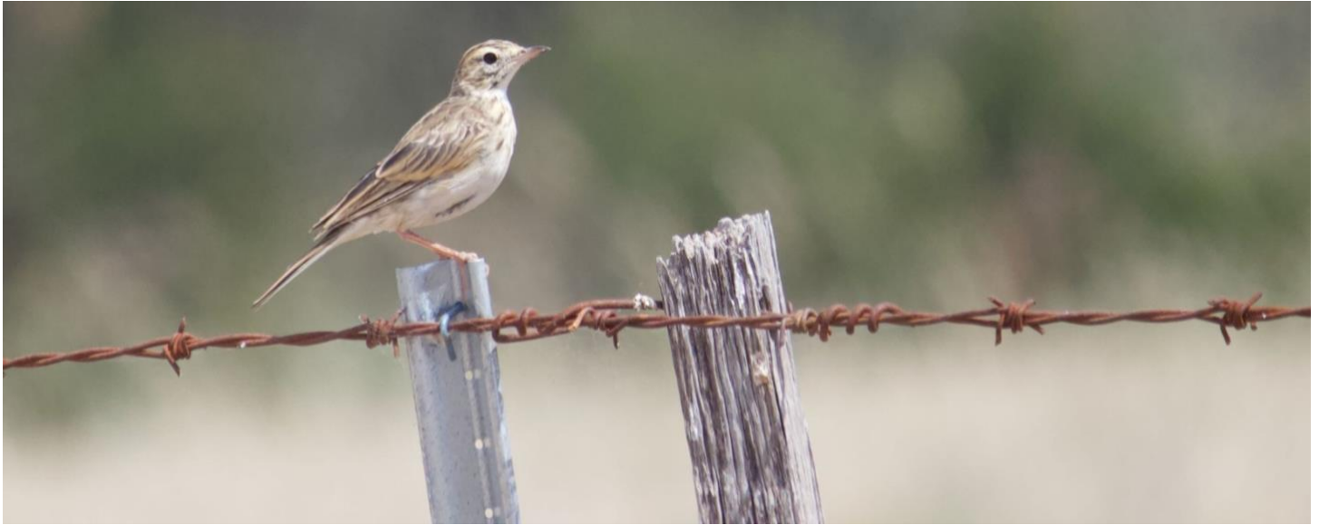
Australian Pipit ( Anzthus australis) observed during the Annual Challenge Bird Count.