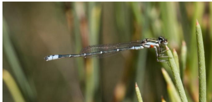
Top - Eastern Billabong fly ( Austroagrion watsoni ) with parasitic red mite attached.