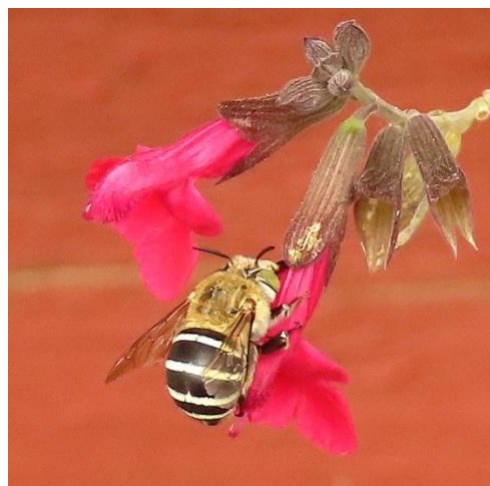
Blue-banded Bee ( Amegilla asserta ). One of several observed on Salvias.