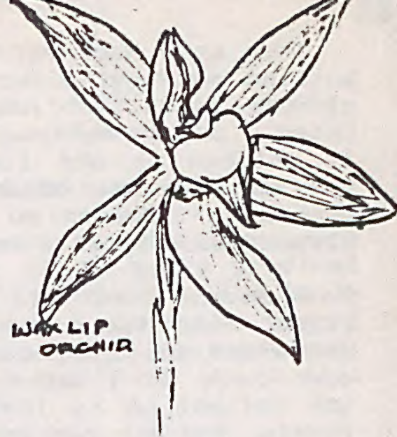
WAX LIP ORCHID